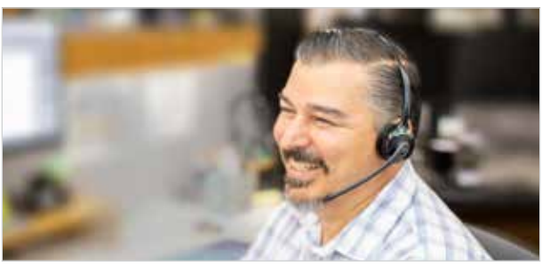
With knowledgeable customer support, A-dec is readily available to assist with installation, operation and maintenance—for the life of the practice.