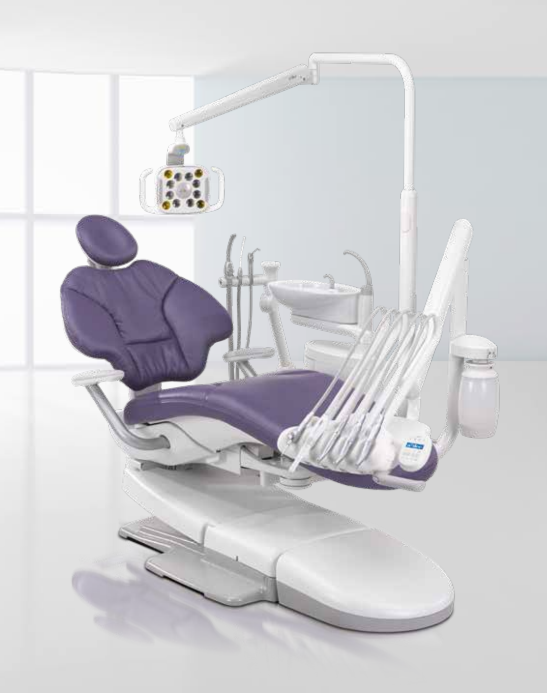
A-dec 400 Sleek design, patient comfort, and uninhibited dental team access combined with solid, reliable performance.