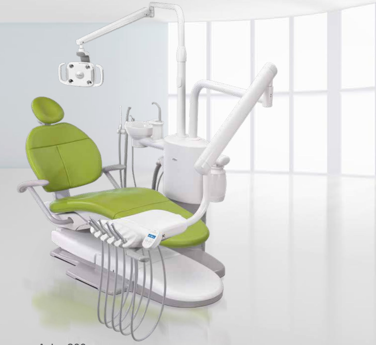
A-dec 300 Stylish and compact. A-dec 300 combines a robust design, great access, and minimal maintenance.